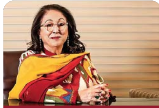
MRS. KIRAN NADAR

Founder – HCL Chairperson Emeritus & Strategic Advisor – HCL Tech Founder & Chairman – Shiv Nadar Foundation