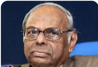
PROF. C. RANGARAJAN

Chairman – Madras School of Economics Chancellor – University of Hyderabad Ex-Governor – RBI Former President – Indian Statistical Inst.