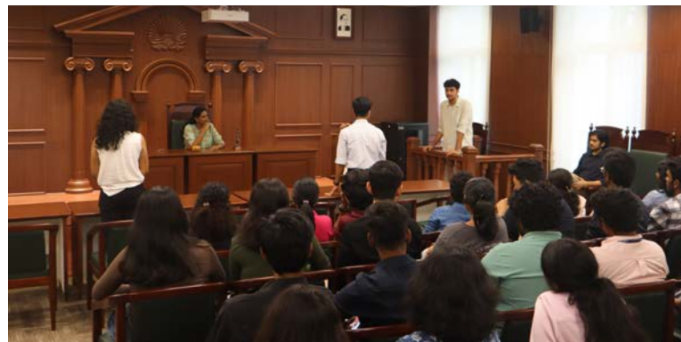
– Moot Court Session at the School of Law