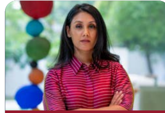
MRS. ROSHNI NADAR MALHOTRA

Chairperson – Kiran Nadar Museum of Art Trustee – Shiv Nadar Foundation