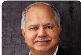
DR. RAJ REDDY

Chairman – Madras School of Economics Chancellor – University of Hyderabad Ex-Governor – RBI Former President – Indian Statistical Inst.